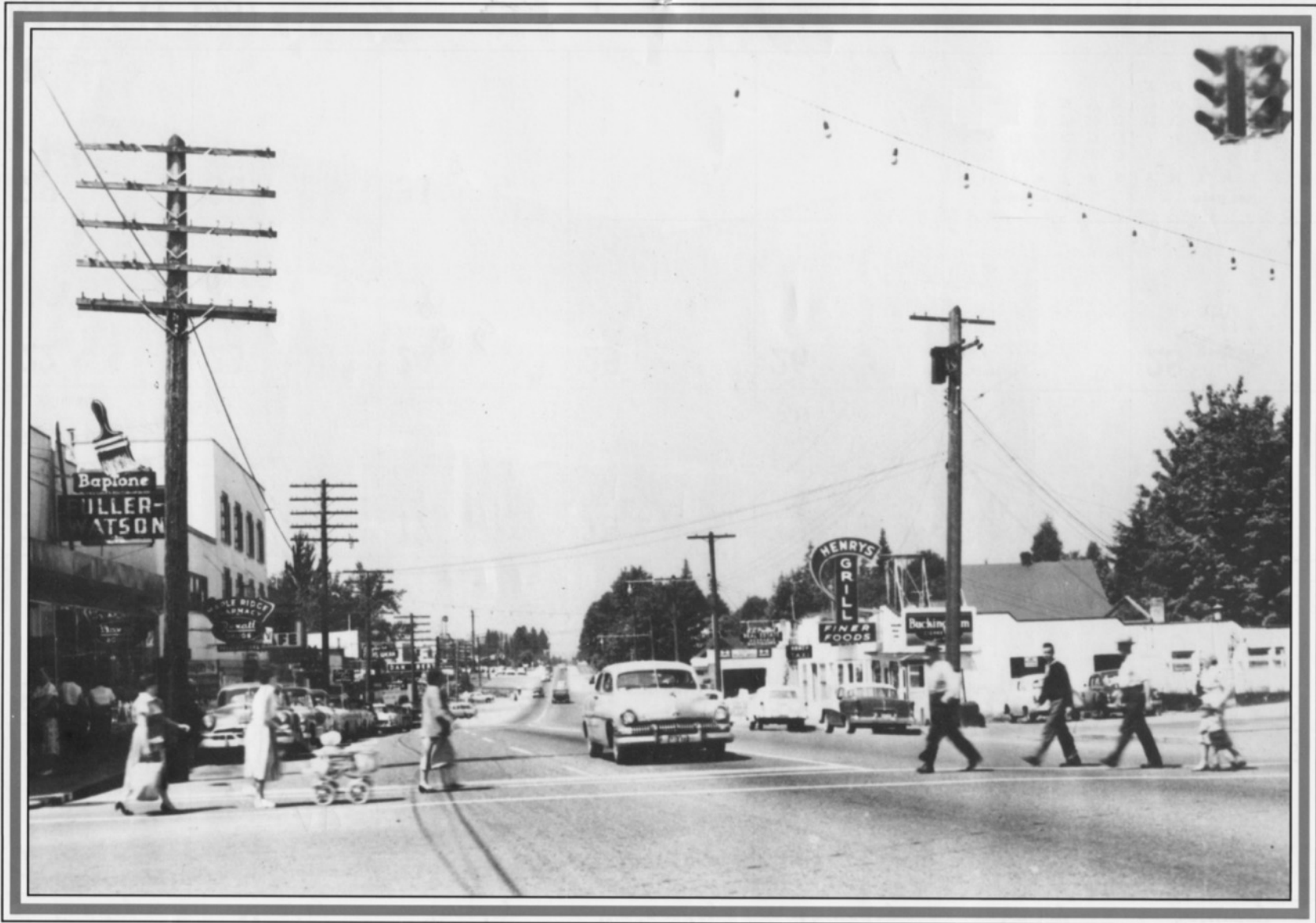
Looking west down Lougheed Highway from 224th Street, c. 1951