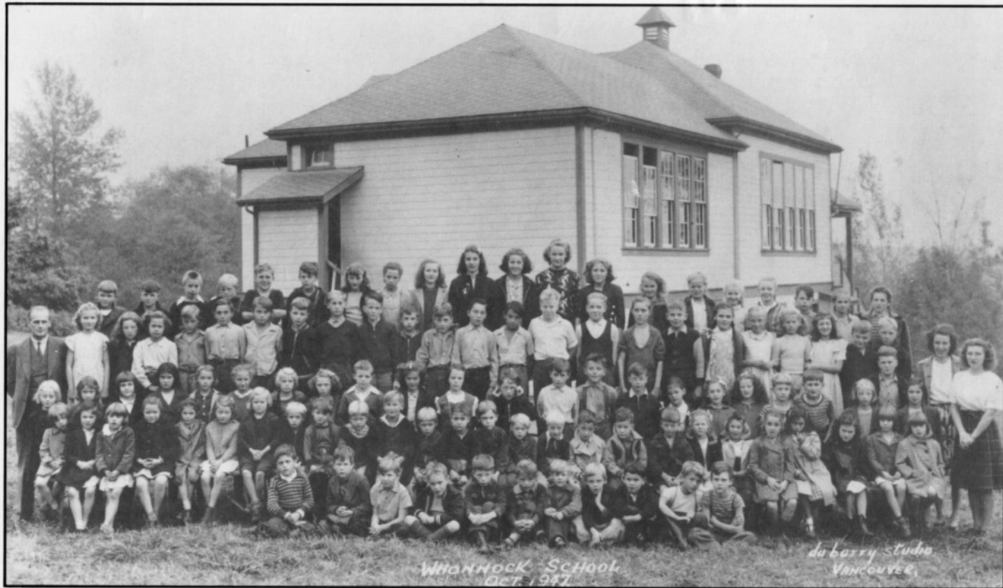
Whonnock School, October, 1947 Located on 100th Avenue and 272nd Street, Whonnock, B.C.