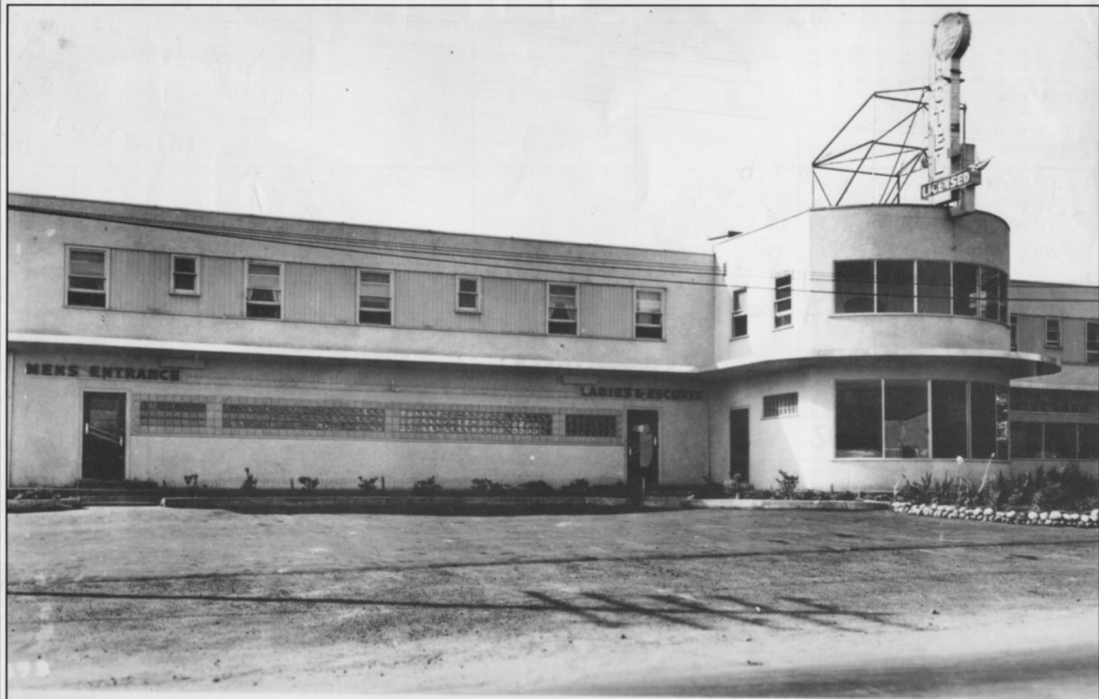
Haney Hotel, Haney, B. C.

Haney Hotel, c. 1951 Notice the separate entrances.