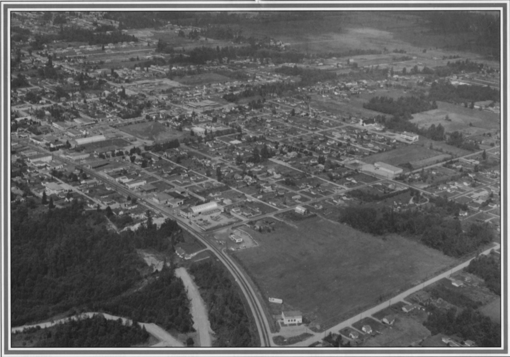
Aerial view of Haney from the southeast, c. 1961 Open Field — Now Valley Fair Mall