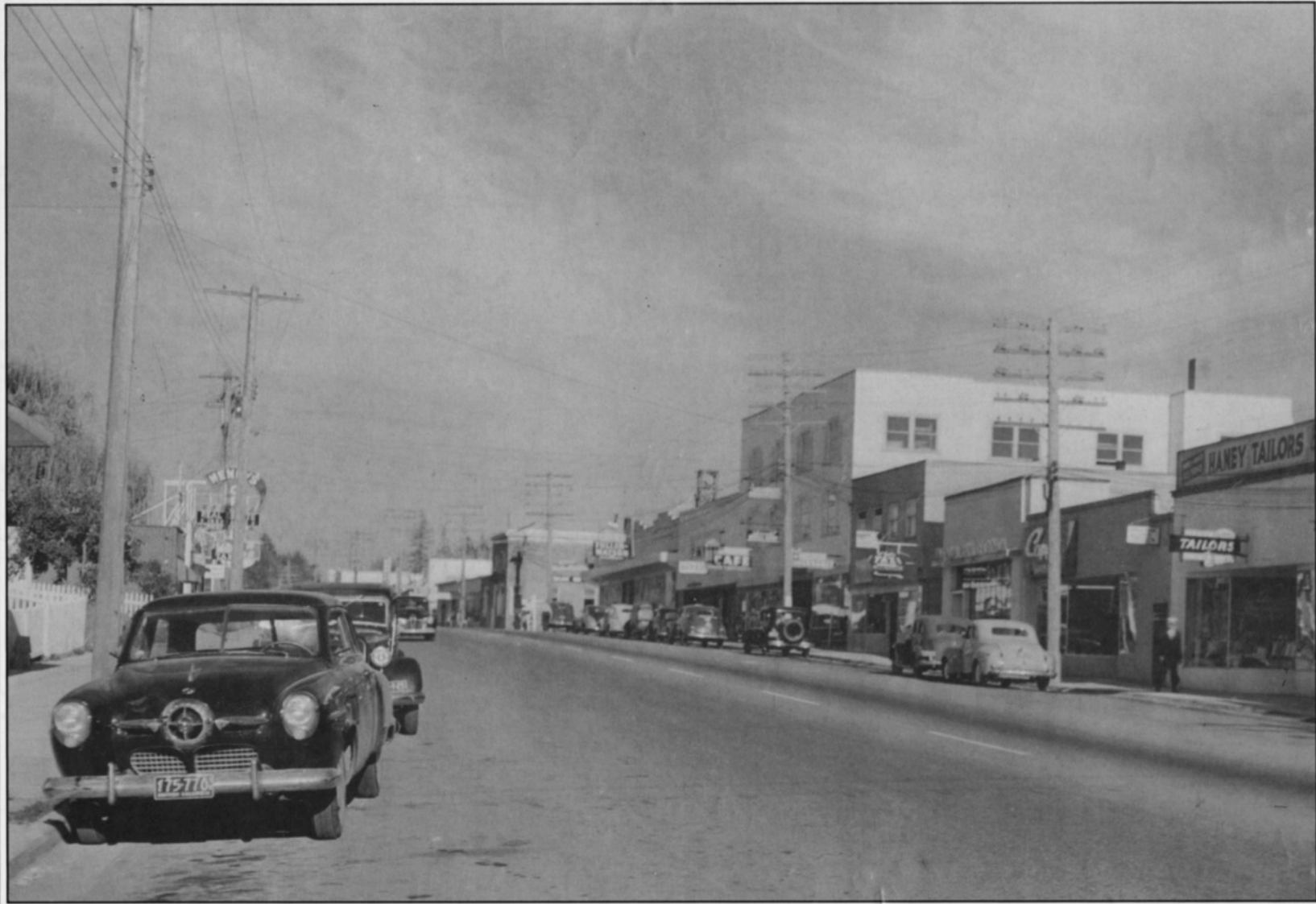
Lougheed Highway looking east, c. 1951