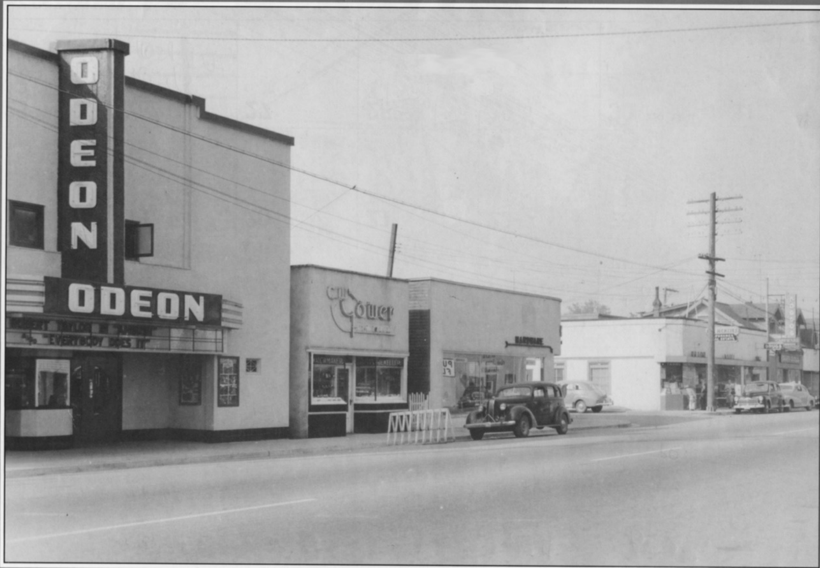
Lougheed Highway looking west, c. 1951