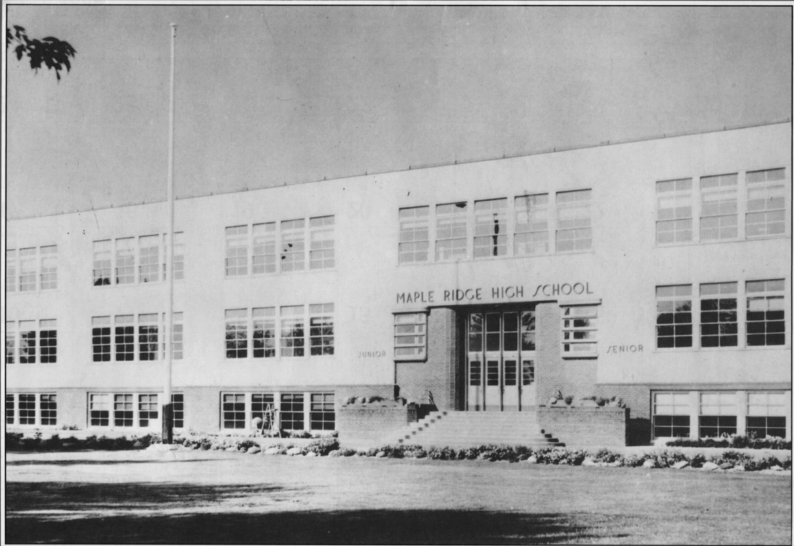
Maple Ridge High School, Haney, c. 1951