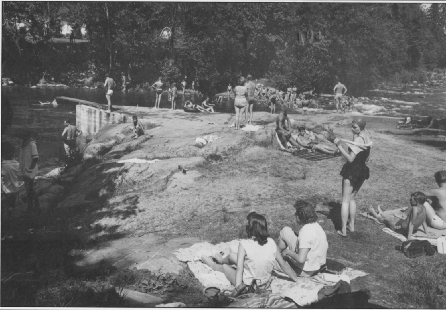
Davison's Pool, c. 1953 Popular swimming hole upstream (east) of Maple Ridge Park.