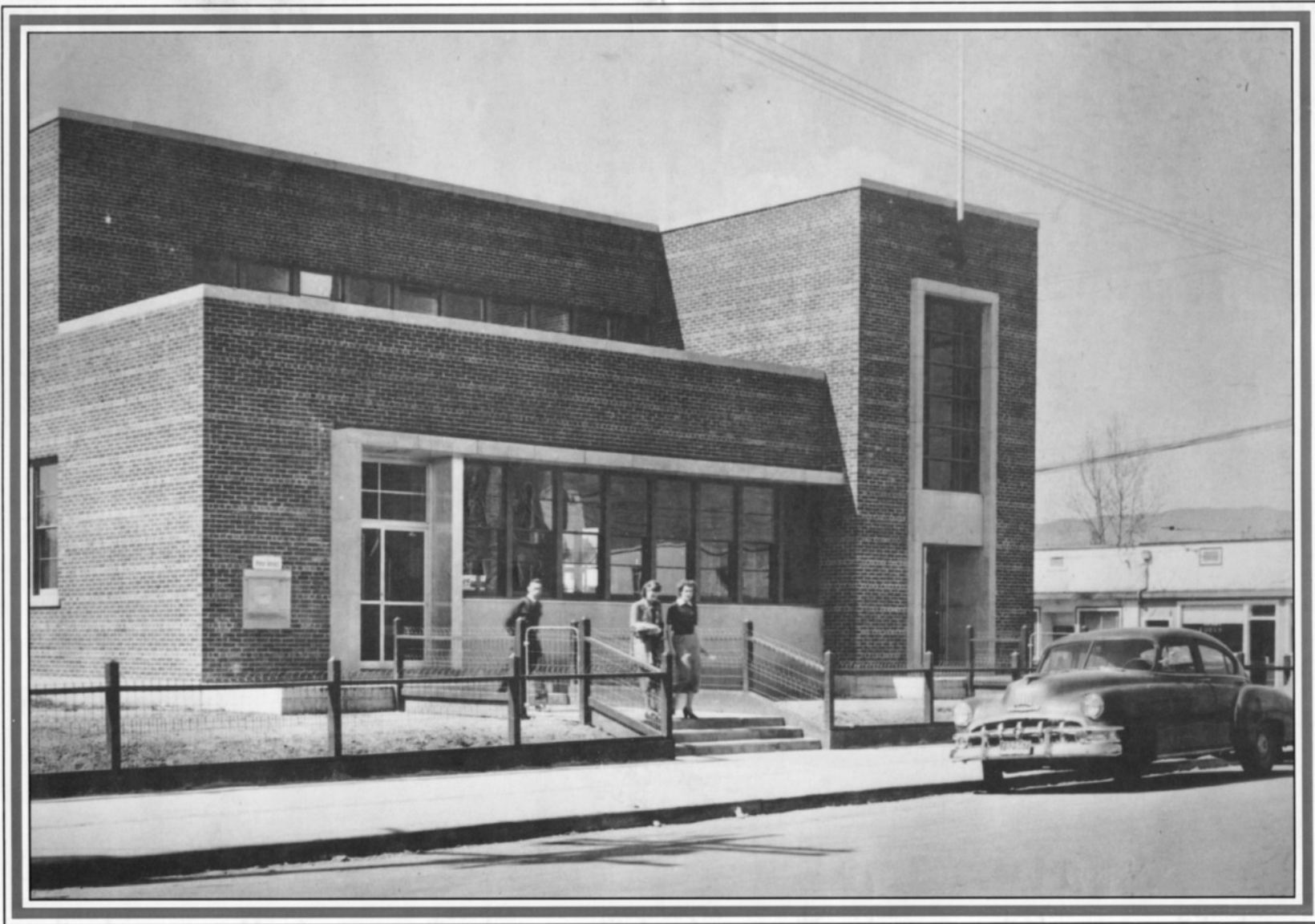
Haney Post Office, c. 1951