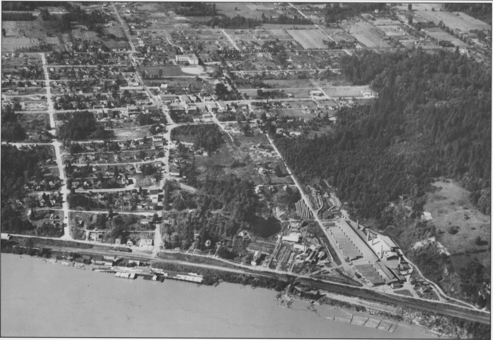
Port Haney from the air, c. 1947